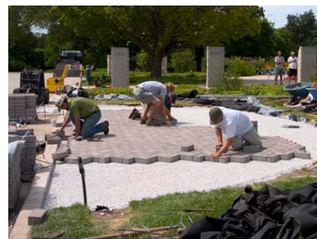
Laying the permeable pavers