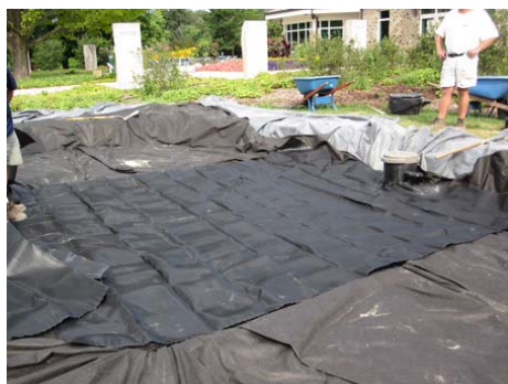
Woven geotextile set over AquaBlox® D-Raintanks®