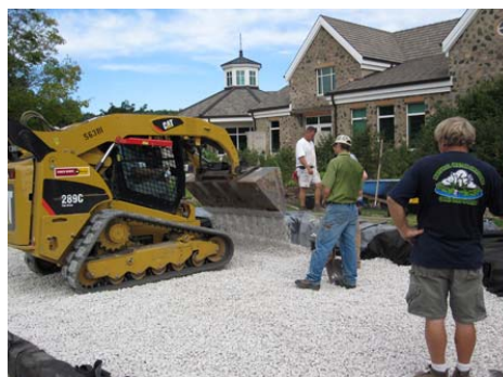
Aggregate layer added before pavers