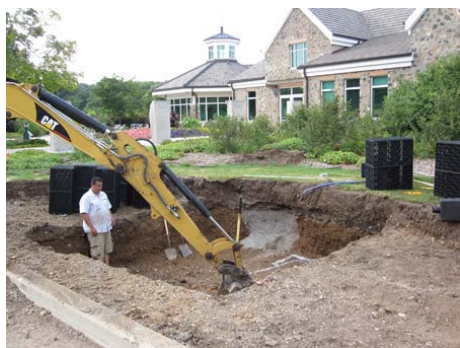
Excavating the reservoir for the patio.