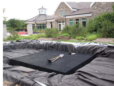
AquaBlox® D-Raintanks® installed.