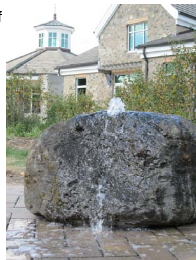
The Education and Visitor Center

A portion of stormwater water is intercepted off the roof of the Education and Visitor Center by a series of downspout filters, the water is then directed to a 4,500 gallon reservoir located beneath a 500 square foot Unilock permeable pavement system. The patio has a recirculating rock feature that aids in the aeration of the stored water. The captured water will be re-used for irrigation of the surrounding gardens, as the water is drawn down in the reservoir it is replenished by water from the larger main reservoir using a small transfer pump.