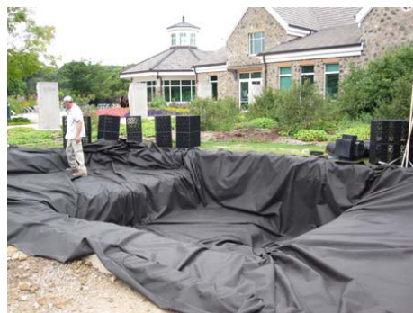
Laying liner for the 500 square foot basin.